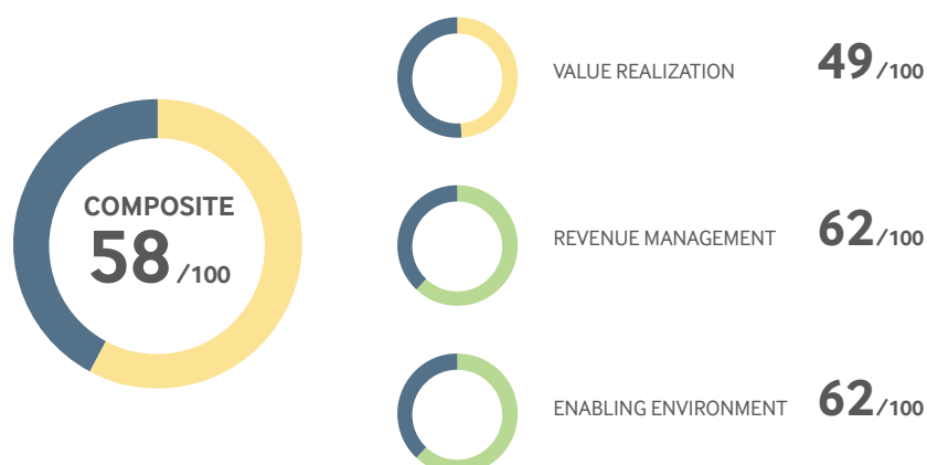
Figure 1. Resource Governance Index subcomponent scores, Mexico interim evaluation (mining)

In contrast, Mexico's mining sector improved by nine points to 62 out of 100 points in the revenue management component. This component improved in both of its assessed policy areas, national budgeting and subnational resource revenue sharing.